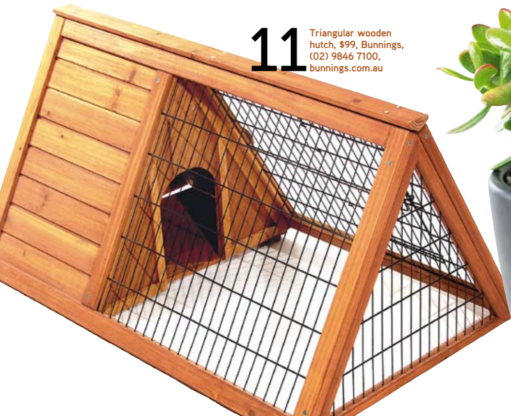
11 Triangular wooden hutch, $99, Bunnings, (02) 9846 7100, bunnings.com.au