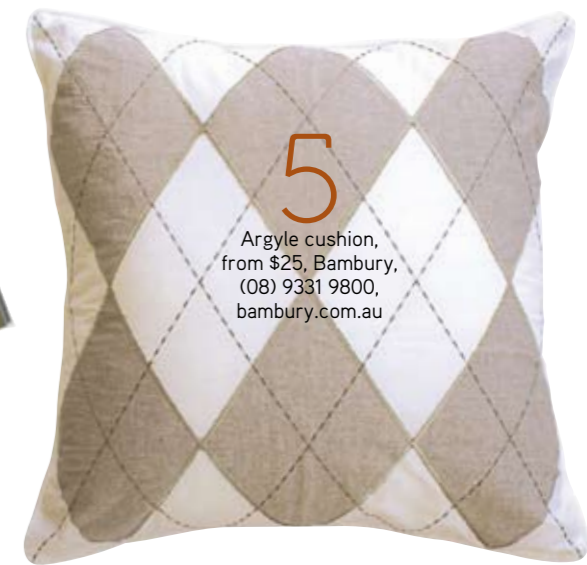
5 Argyle cushion, from $25, Bambury, (08) 9331 9800, bambury.com.au