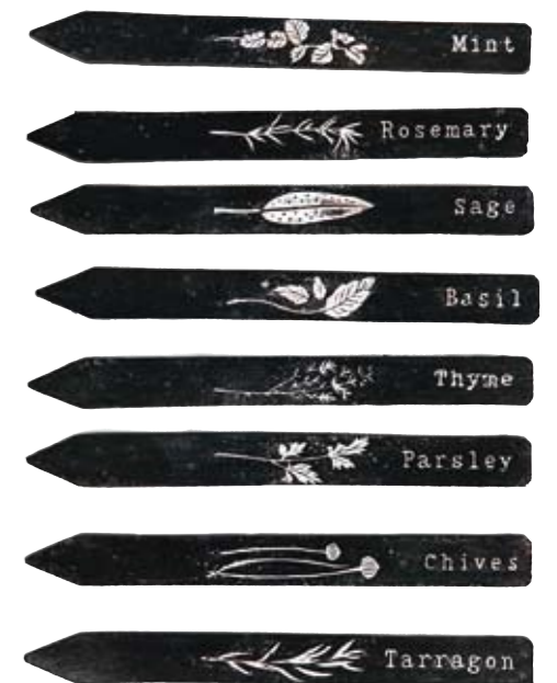
7 Herb stakes, $5 for 8-pack of 10cm resin stakes, Patio by Jamie Durie, exclusive to BIG W, 1800 251 311, patiobyjamiedurie.com.au