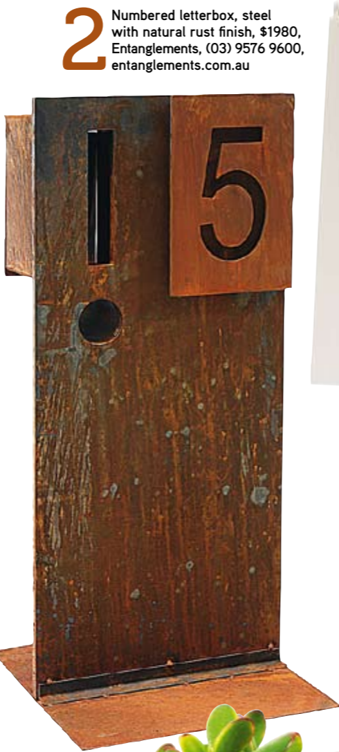
2 Numbered letterbox, steel with natural rust finish, $1980, Entanglements, (03) 9576 9600, entanglements.com.au