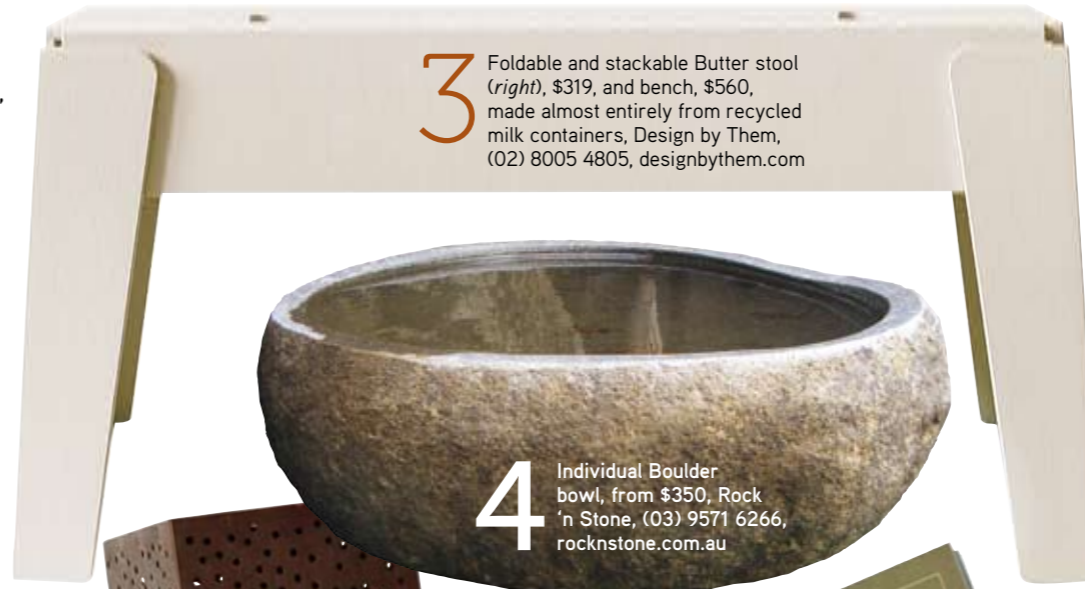
3 Foldable and stackable Butter stool (right), $319, and bench, $560, made almost entirely from recycled milk containers, Design by Them, (02) 8005 4805, designbythem.com