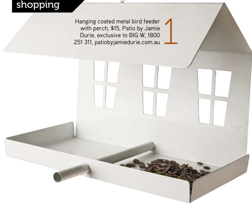
Hanging coated metal bird feeder with perch, $15, Patio by Jamie Durie, exclusive to BIG W, 1800 251 311, patiobyjamiedurie.com.au