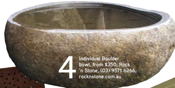
4 Individual Boulder bowl, from $350, Rock 'n Stone, (03) 9571 6266, rocknstone.com.au