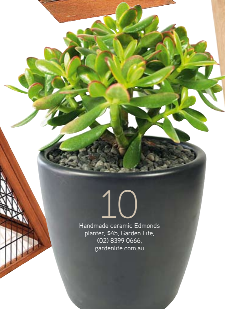
10 Handmade ceramic Edmonds planter, $45, Garden Life, (02) 8399 0666, gardenlife.com.au